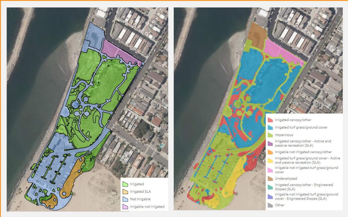
Samples of OCDAP imagery used to measure and classify landscapes remotely.

JOIN THE COLLABORATIVE AND SIGN UP FOR CYCLE 3