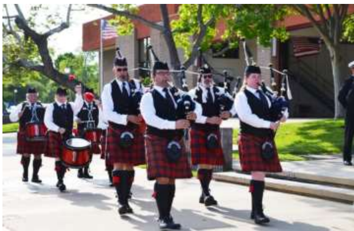
Đội kèn Nicholson Pipes and Drums