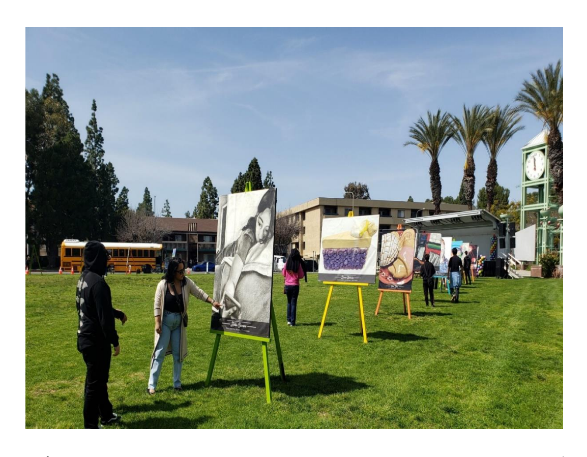
Triển lãm "First Impression" ngoài trời thông thoáng hơn trong phòng tranh nhiều.

Học Khu Garden Grove có 66 trường học và 38,560 học sinh. Tỷ lệ tuyển sinh thiểu số của học khu là 90%. Ngoài ra, 47% học sinh có hoàn cảnh khó khăn về kinh tế.