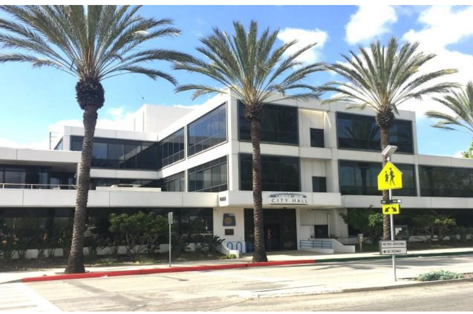
Garden Grove City Hall

Firearms, Fords and furniture were all on the agenda for Tuesday's meeting of the Garden Grove City Council and they were all approved.