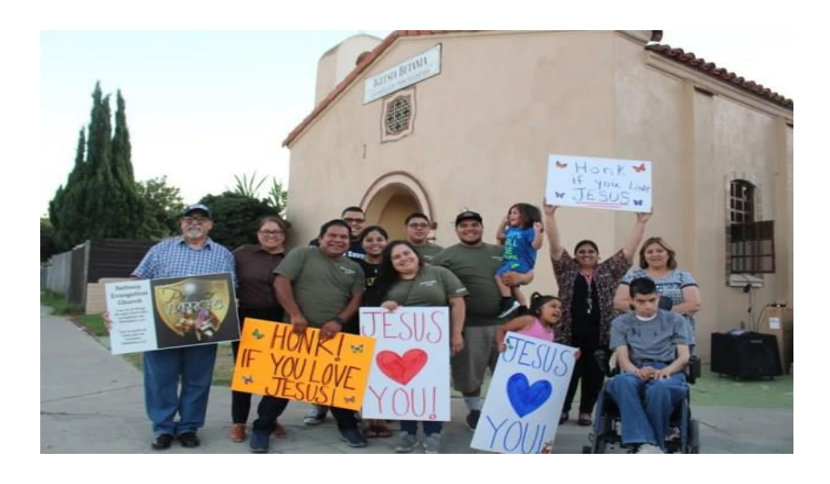
Fourth in a series celebrating the 150th anniversary of the 1874 founding of Garden Grove.

Much is made today of cultural diversity in Garden Grove, but it's really nothing new. Diverse communities of ethnicity and faith have long been part of The Big Strawberry's history.