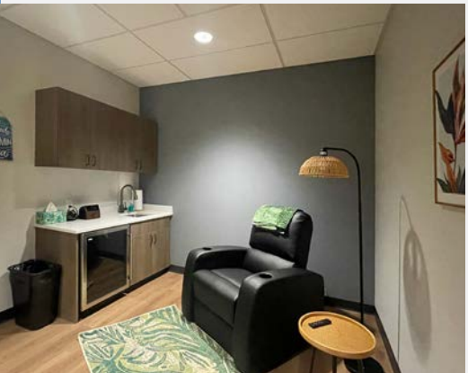
A wellness room designed by Roth Sheppard for a previous project, similar to the ones the Garden Grove Public Safety Facility will include.

Supporting officer mental health is central to the Garden Grove station's design. Recognizing the high-stress nature of police work, the station features four private, comfortable, and acoustically isolated wellness rooms. Officers can book these spaces if they need time to decompress, reflect, or relax. Furthermore, the design team recognized the department has uniquely close, familial relationships, so key leadership offices are open and centrally located, fostering supportive interactions that are crucial for well-being in a demanding profession. Through these approaches, the design intentionally provides environments to support officer well-being.