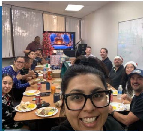
The project team enjoying their holiday lunch!

Every year, the Garden Grove Police Department participates in the Shop With a Cop initiative. GGPD, in collaboration with Target, pairs officers with kids in the community to go shopping for holiday gifts—but the event is time-limited, and every year there are kids who can't participate in the event itself. GGPD wanted to find some way to bring the joy to these children as well, and the Edgemoor team held a toy drive in the project office. Edgemoor and Clark collected toys for the kids who couldn't participate and delivered them to GGPD on December 9. GGPD distributed them to children throughout the rest of the week. To thank the team members who generously donated gifts, Edgemoor bought lunch for the office during the team's holiday gathering.