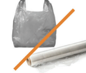
Plastic Bags & Wrap