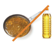
Fats, Oils & Grease