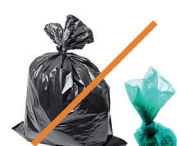
Trash & Pet Waste

PRESORTED STANDARD U.S. POSTAGE PAID GREENFIELD, IN PERMIT NO. 220