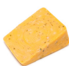
Cheese and Dairy