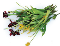
Garden Trimmings and Plants