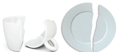
Dishes and Mirrors