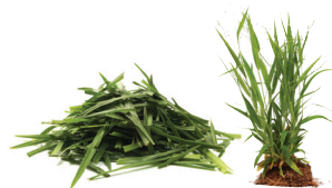
Grass and Weeds