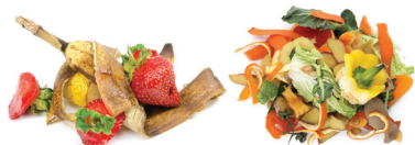
Fruits and Vegetables