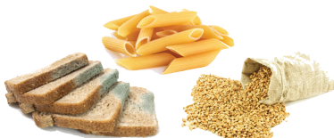
Bread, Grains and Pasta