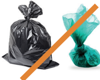
Trash and Pet Waste