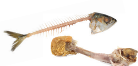
Cooked Meat and Bones