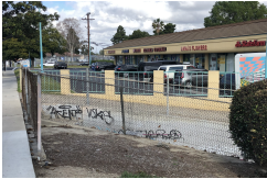
IMG-6145.jpg 3 MB