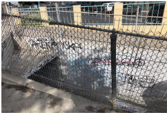
IMG-6146.jpg 4 MB