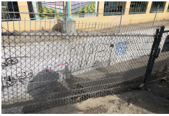
IMG-6148.jpg 5 MB