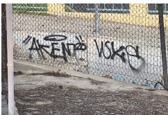
IMG-6144.jpg 2 MB