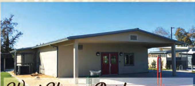
West Haven Park 12252 West Street, Garden Grove, 92844 Can accommodate up to 60 people (NEW)

ATLANTIS PLAY CENTER: 13630 ATLANTIS WAY, GARDEN GROVE, 92844 • (714) 892-6015