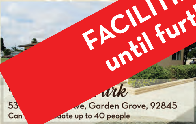
Garden Grove Park 53...ve, Garden Grove, 92845 Can accommodate up to 40 people