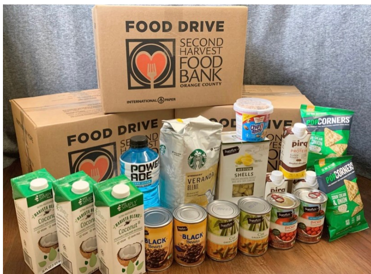
Shelf-stable food donation from Second Harvest Food Bank

The 9702 Chapman Corporation generously donated 500 cloth masks to be distributed to senior citizens in the community. The managers of the corporation wanted to ensure that all seniors picking up meal during the Center's weekly distributions could safely leave their homes with a mask.