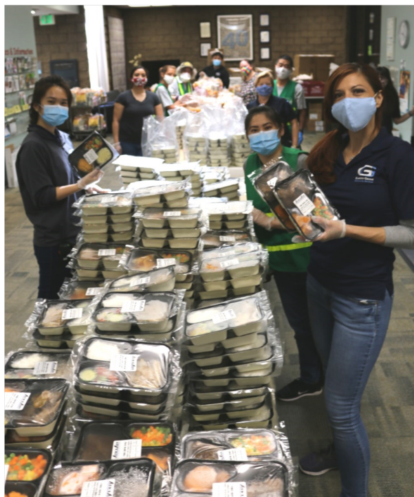
Senior Center frozen meal assembly, April 2020

Find a digital version of this newsletter online at www.ggcity.org/seniorcenter