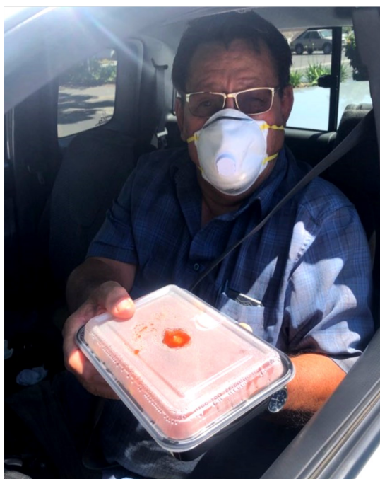
Donated meal from Carolina's Italian Restaurant

We are grateful for this partnership that has resulted in over 200 shelf-stable food boxes being distributed to help supplement seniors with food needs during COVID-19. One box packed with groceries is distributed per household on Tuesdays in conjunction with the Frozen Meal program while supplies last.