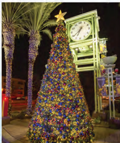
GGCF Spectacular Tree Lighting