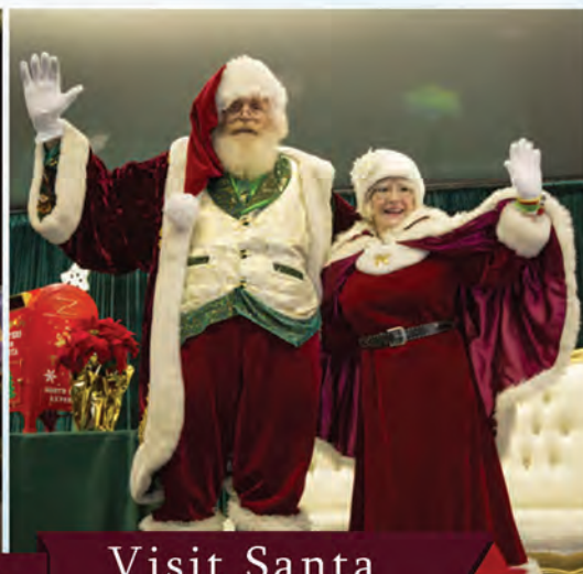
Visit Santa & Mrs. Claus