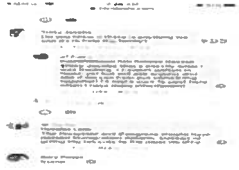
IMG_8625.PNG 399 KB