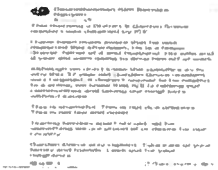
GG.CCW.KBN.10.08.20.jpg 297 KB