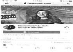
IMG_8623.PNG 2 MB