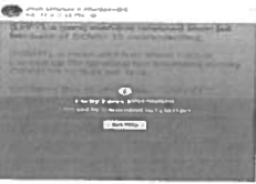
JL2.JPG 33 KB