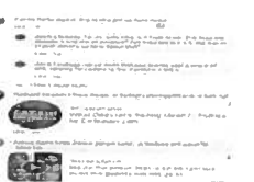
JL9.JPG 48 KB