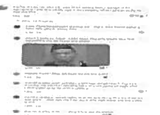
JL5.JPG 41 KB