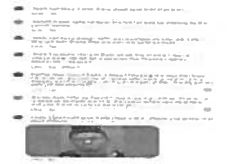
JL6.JPG 40 KB