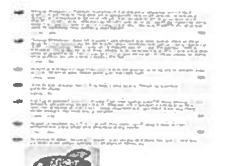
JL8.JPG 53 KB