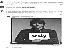
JL4.JPG 38 KB