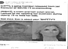
JL3.JPG 48 KB