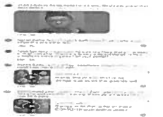
JL7.JPG 43 KB