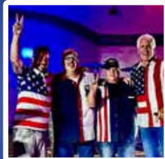
THE ANSWER (CLASSIC ROCK)