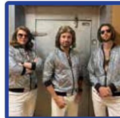
JULY 30 BEE GEES FEVER (BEE GEES TRIBUTE)