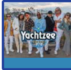
JULY 9 YACHTZEE (YACHT ROCK)