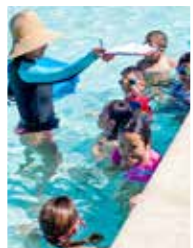
Advanced Learn to Swim

NEW PROGRAMMING COMING SOON TO WOODBURY PARK POOL!