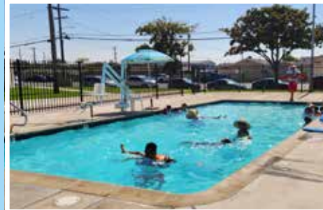
MAGNOLIA PARK POOL 11402 MAGNOLIA STREET