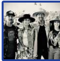
JULY 16 KELLY BOYZ BAND (COUNTRY)