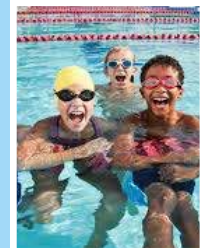
Youth Swim Team

For more details about new and returning aquatics programming check our Website: ggcity.org/aquatics