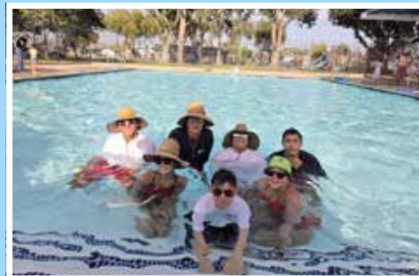
GARY HALL POOL 12001 ST MARK STREET

NEW PROGRAMMING COMING SOON TO WOODBURY PARK POOL!