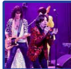
JULY 23 START ME UP (ROLLING STONES TRIBUTE)