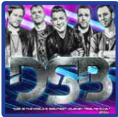
JUNE 18 DSB (JOURNEY TRIBUTE)