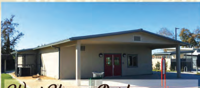
West Haven Park 12252 West Street, Garden Grove, 92844 Can accommodate up to 60 people (NEW)

ATLANTIS PLAY CENTER: 13630 ATLANTIS WAY, GARDEN GROVE, 92844 • (714) 892-6015