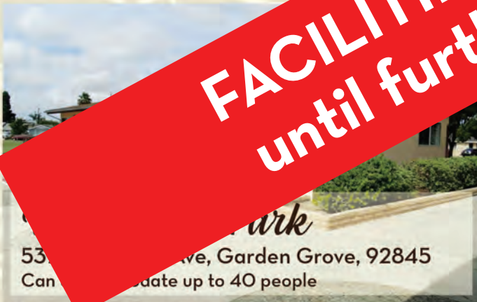
West Haven Park 53...ve, Garden Grove, 92845 Can accommodate up to 40 people