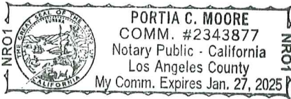
Place Notary Seal and/or Stamp Above

Signature [Handwritten Signature] Signature of Notary Public