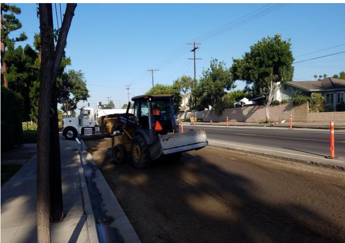
Making access ramps.