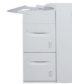
2-Tray High-Capacity Feeder 2,000 sheets each tray (4,000 sheets total): Letter-size