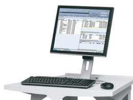
Xerox® FreeFlow Print Server