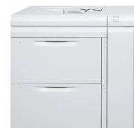
2-Tray Oversized High-Capacity Feeder* 2,000 sheets each tray (4,000 sheets total): Up to 13 x 19.2 in.