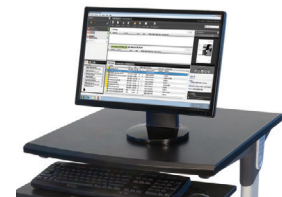
Xerox® EX Print Server, powered by Fiery