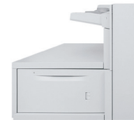
Oversized High-Capacity Feeder 2,000 sheets: Up to 13 x 19.2 in.