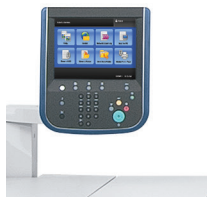
Integrated Copy/Print Server