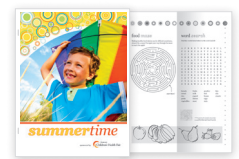
Color Inserts, Stapling and Engineering Z-Folding