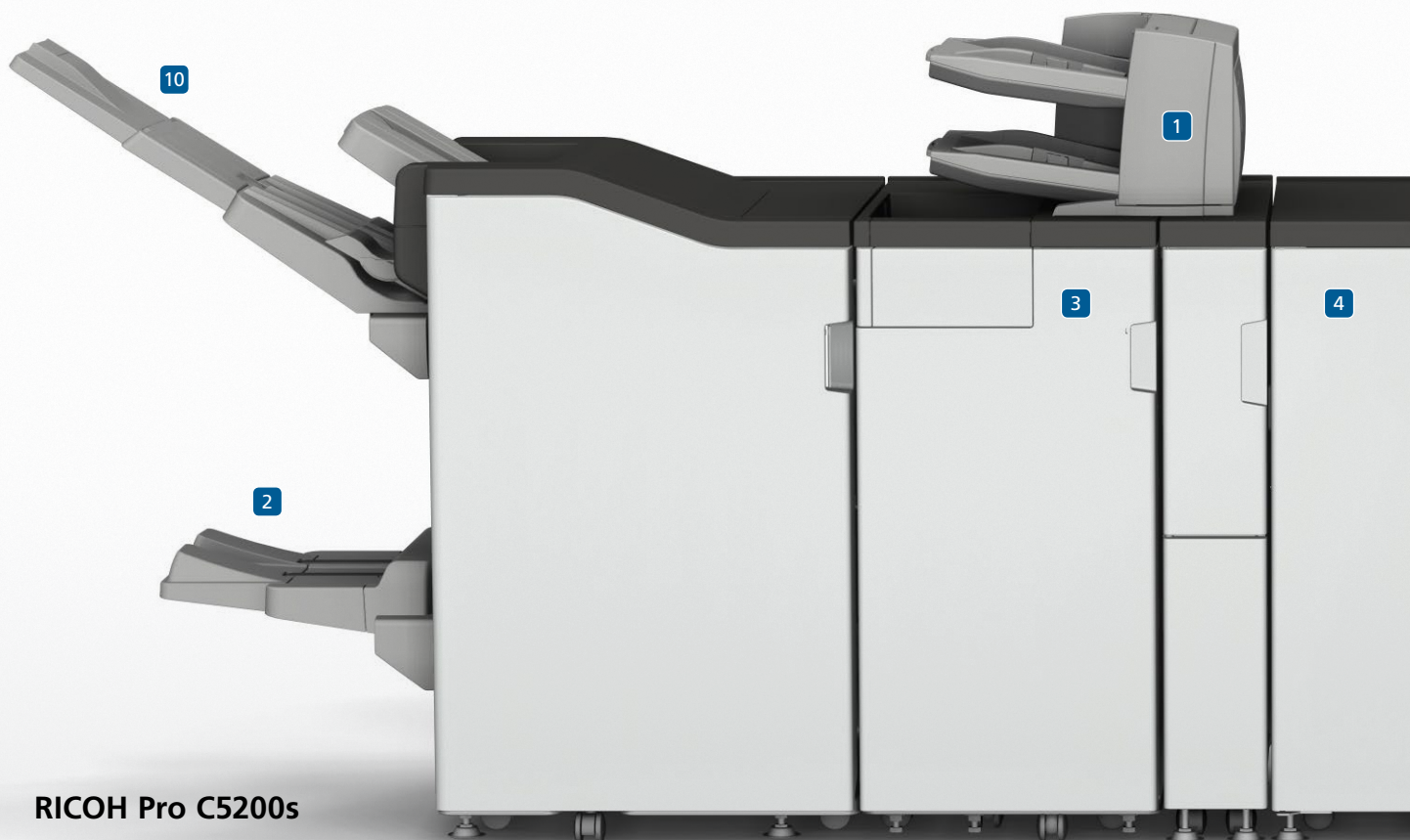
RICOH Pro C5200s