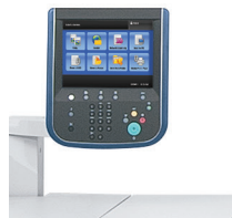
Integrated Copy/Print Server